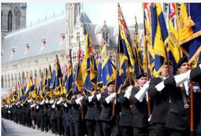
The RBL Y Services Branch was on parade in Ypres for GP90

https://www.britishlegion.org.uk/get-involved/things-to-do/membership/our-members/legion-100/telling-our-story