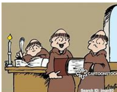
THIS BIBLE IS FINISHED SO CAN YOU DO A SPELL CHECK PLEASE FATHER BARNABUS.

Preferred format is unformatted MS Word and any photos, cartoons or pictures should be submitted separately as JPEGs