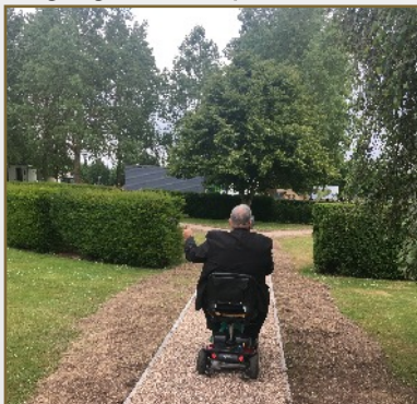
A big thumbs up from a (heavy) mobility scooter user

It was also decided to explore the feasibility and costs of replacing the loose gravel pathway and wooden edging on bare earth, with a more permanent and low maintenance surface. Several contract bids later, problems with a builder who withdrew through illness, delays due to Covid-19 and many days of wet weather we found ourselves in March and April 'discussing' terms for cost of the maintenance with the NMA. An agreement for annual maintenance was reached and work began on 14 June 2021. Lichfield based firm D McCarthy Brothers Ltd carried out the work, which was completed on Friday 18 June 2021. The new footpath needs a little tweaking due to an excess of gravel provided by the contractor and this is in hand. Once the grass along the new edging stones pokes its way through the whole appearance of the site will be greatly enhanced.