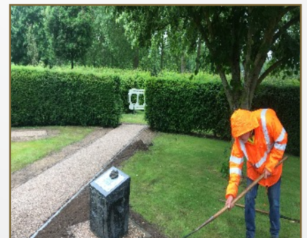
Spreading topsoil and re-seeding the edges

The cost of maintenance up to and including 30 October 2021 has been covered by funds already ringfenced for the purpose. The cost of the footpath refurbishment has been funded from the very successful appeal held in the Spring.