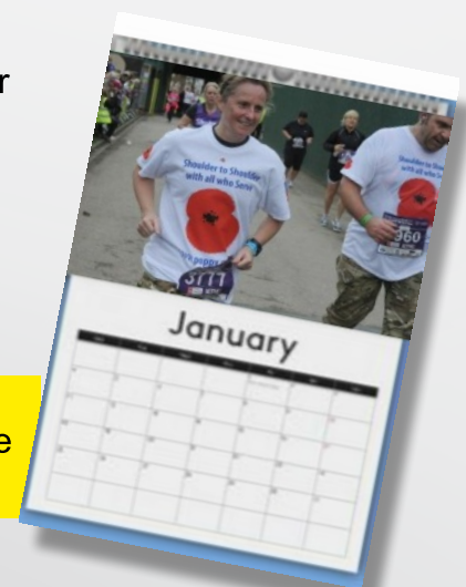
Calendar mock up for illustration

All profits will go via the Branch to the Poppy Appeal