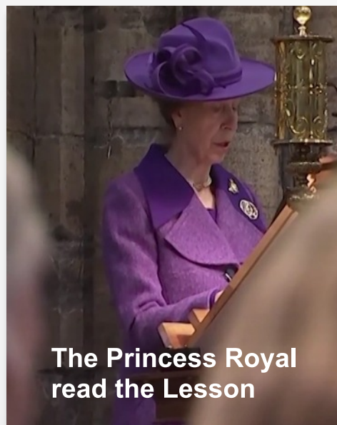
The Princess Royal read the Lesson

The State Trumpeters of the Household Cavalry and the fanfare team from the Band of the Grenadier Guards were in attendance along with The Legion's own Central Band.