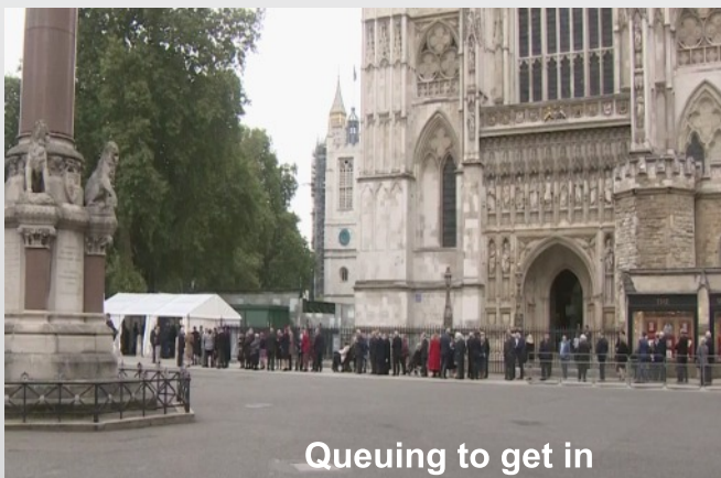
Queuing to get in