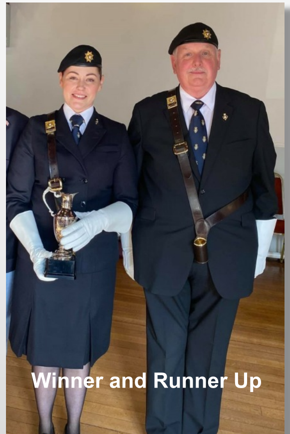
Winner and Runner Up