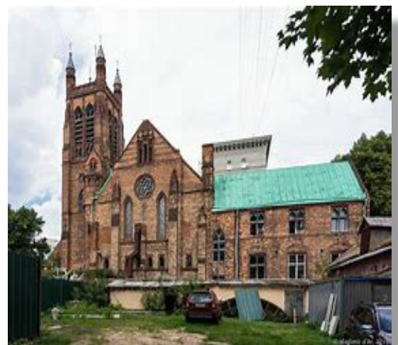
Saint Andrew' Anglican Church, Moscow

At the time, I was the Embassy's CLO (Community Liaison Officer) and had apparently been included in the guest list for lunch in recognition of my work with both the embassy community and other English speaking embassies. With the mantra of "don't fall over" I managed to execute a fairly competent curtsey as I was presented to their majesties before lunch. I was struck by how petite she was. I had imagined her as taller but there was no mistaking her clear gaze.