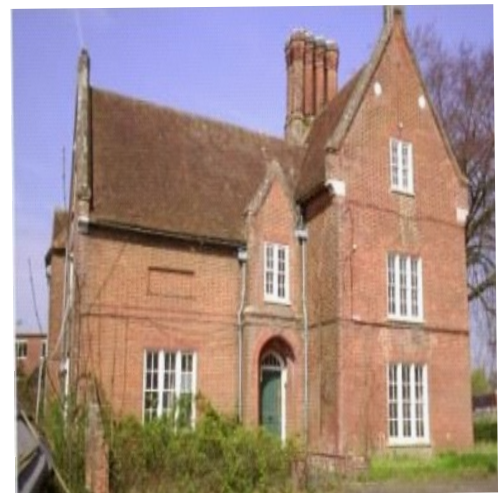
Repton Manor, Templar Barracks