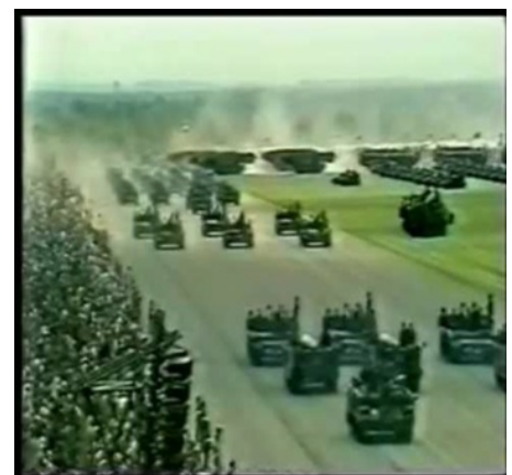
HM Queen Review of the Army Sennelager 070777