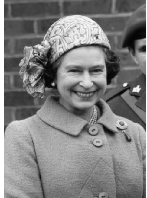
HM Queen visiting Templar Barracks March 1981

Preferred format is unformatted MS Word and any photos, cartoons or pictures should be submitted separately as JPEGs.