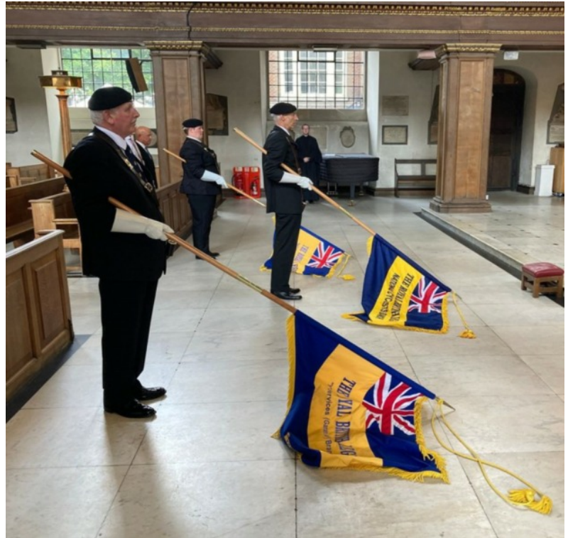
From top, the National Professionals, the Cyclists and the Y Services Branch standards being dipped for the National Anthem