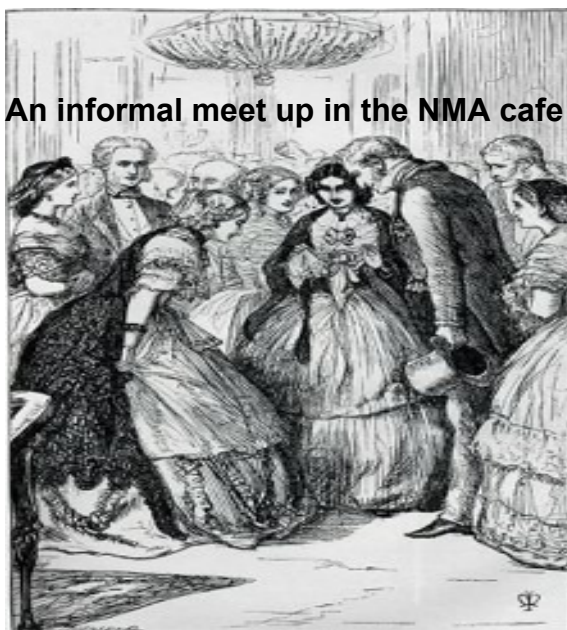
An informal meet up in the NMA cafe