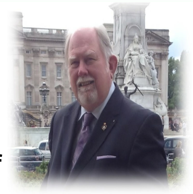
See story on page 2