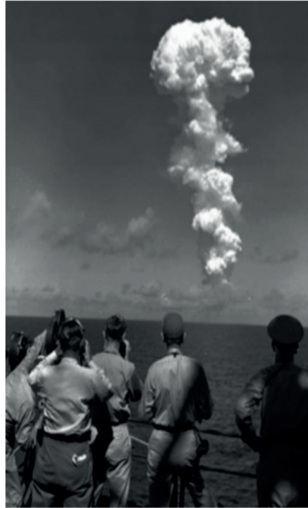
Nuclear bomb test

The Medal is also awarded to UK personnel who served at locations where American atmospheric nuclear tests took place in 1962 under Operation DOMINIC.