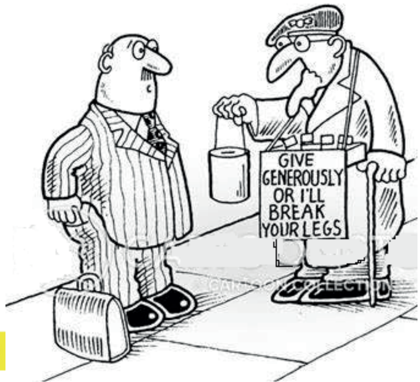
“Are there many ex-Paras in the British Legion then?”

Thank you one and all for your kind contributions