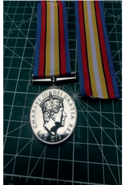
The Nuclear Test Medal

My badge and medal and some tatty bit of paper arrived 2 days ago. The box was pushed through my letter box and dropped on the floor. I was disgusted with the government and Ministry of Defence for the way they presented it to us. The medal has no inscription on it, it should have my name & service number at least. This is an insult to us survivors but more importantly to all our friends who have lost their lives due to the radiation. Most of them got cancer, leukaemia or other killing illnesses.