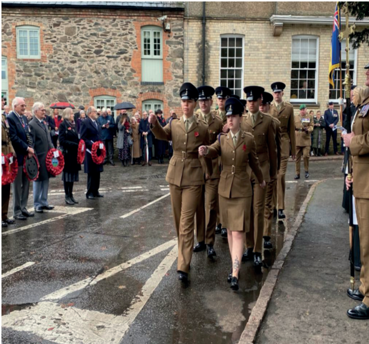
The Chicksands detachment get on parade

After the service and wreath laying, the congregation joined the clergy in the Old Woodhouse village hall for tea and biscuits, together with a great deal of lantern swinging as old soldiers, many of whom had been trained at the old Garats Hay barracks, related tales of their exploits to the younger soldiers present.