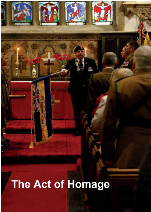
The Act of Homage

a uniformed Royal Artillery SNCO assisted the clergy. A real feast for the hat badge spotters. The pews were quickly filled with people from the village, veterans and their families from the Royal British Legion Y Services Branch and members of the Royal Signals Association Loughborough Branch. A soldier carried the crucifer and led the clergy and the Legion Y Services Branch Standard into the church to the processional hymn 'O God our help in ages past'.