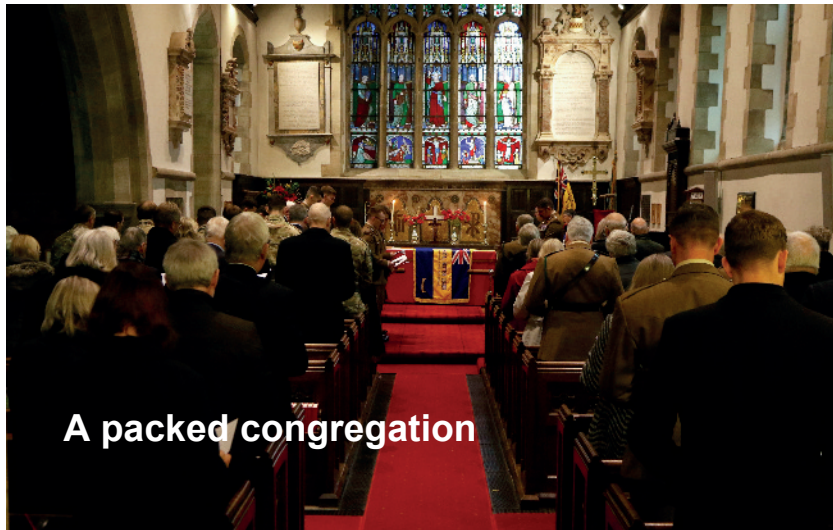
A packed congregation

Remembrance Sunday is almost always cold, dry and sunny. This year (2023) there were grey skies over Old Woodhouse and as people arrived at St Mary in the Elms church a fine drizzle threatened