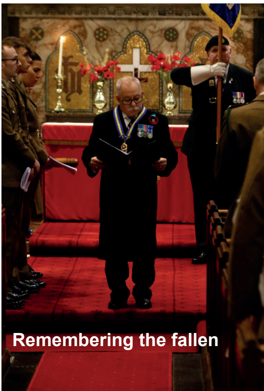
Remembering the fallen

'When You Go Home, Tell Them Of Us And Say, For Your Tomorrow, We Gave Our Today.'