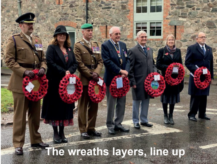
The wreaths layers, line up

After the service and wreath laying, the congregation joined the clergy in the Old Woodhouse village hall for tea and biscuits, together with a great deal of lantern swinging as old soldiers, many of whom had been trained at the old Garats Hay barracks, related tales of their exploits to the younger soldiers present.